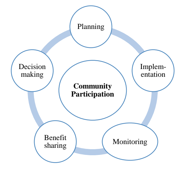
Fig. 2: Elements of Community Participation (Lyndon et al., 2012 as cited in Sulaiman et al., 2014: 2442)

Challenging Lyndon's argument, Wilson and Wilde (2003) established a framework consisting of four distinct aspects that pertain to community participation: influence, inclusiveness, communication, and capacity (as cited in Sulaiman et al., 2014). Cavaye (2010) drew an analogy to an onion ring characterized by layers that include the essence of the community, including those actively engaged, those passively involved, as well as those who possess awareness but lack active involvement. Individuals who possess knowledge of a certain project or activity but lack interest in it might be categorized within the bigger group referred to as the "aware circle" (as cited in Sulaiman et al., 2014). According to this analysis, seven characteristics of community engagement have been taken into account to better comprehend these three models in this study (Fig 3).